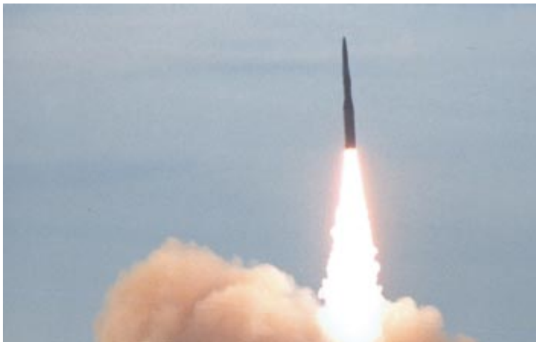
Intercontinental ballistic missile systems are able to strike quickly once the decision to employ nuclear weapons has been made.