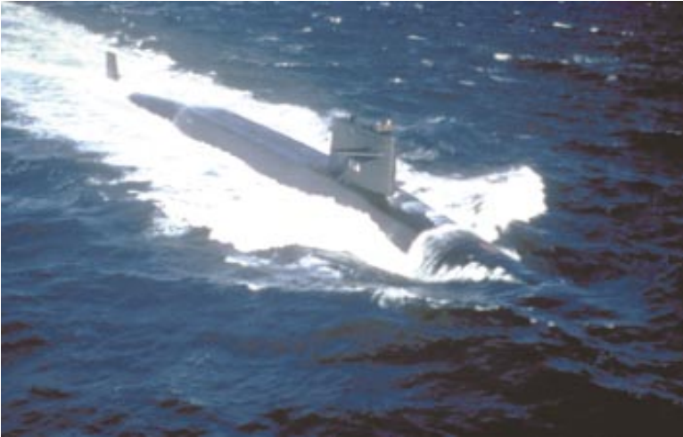
Sea-launched ballistic missiles deter potential aggressors from initiating an attack and remain deployed and ready should deterrence fail.

b. Strategy. Credible and capable nuclear forces are essential for national security. During World War II, nuclear weapons were instrumental in ending the war on terms favorable to the allies. The US postwar strategy has been one of deterrence, and nuclear forces have been developed,