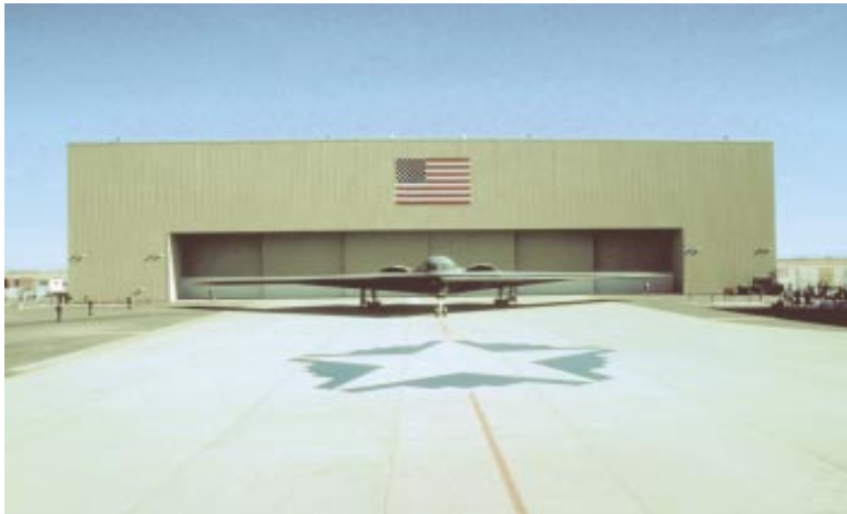
The bomber leg of the strategic Triad provides a flexible and recallable nuclear capability, which is essential in escalation management.

strategic force posture by eliminating intermediate retaliatory steps, there may be a rapid escalation. The ability to precisely gauge the attrition of conventional and nuclear forces will directly effect calculations on the termination of war and the escalation to nuclear war.