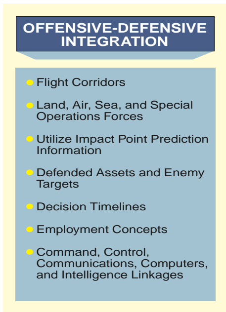
Figure III-4. Offensive-Defensive Integration