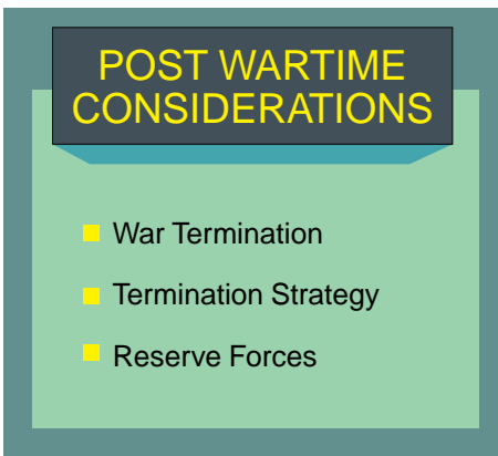
Figure I-3. Post Wartime Considerations