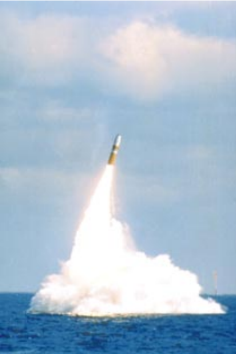
Sea-launched ballistic missiles provide an effective, survivable capability for the purpose of deterring large-scale aggression against the United States and its allies.

capable of striking these targets within the brief time available. Responsiveness (measured as the interval between the decision to strike a specific target and detonation of a weapon over that target) is critical to ensure engaging some emerging targets.