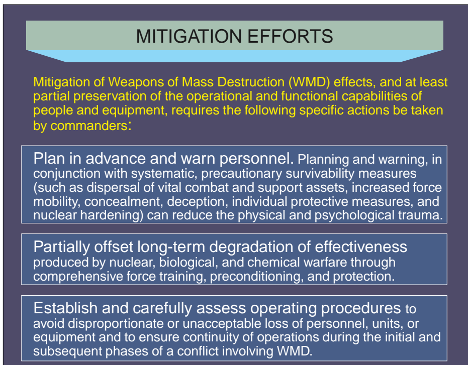
Figure II-3. Mitigation Efforts

b. Mitigation Efforts. Actions required to mitigate the effects of WMD are shown in Figure II-3.