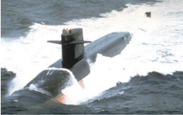
Each leg of the Triad brings a unique set of characteristics to be integrated with the other two, thus forming an effective strategic force.

important is consideration of the effect of enemy defense capabilities and limitations.