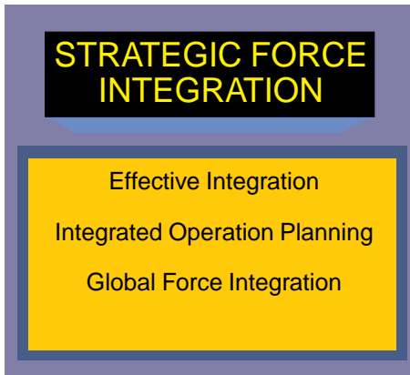
Figure III-1. Strategic Force Integration